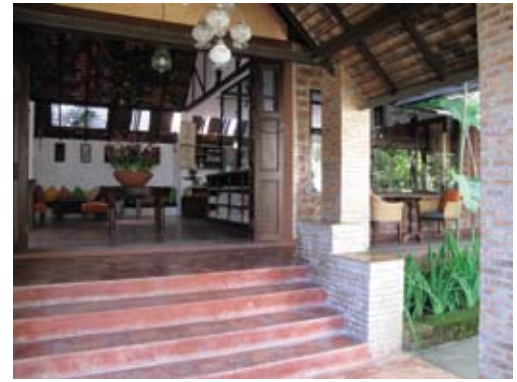
The Nang Fah Project Center in Chiang Mai is located near Doi Suthep Mountains and is close to Chiang Mai University.

Nang Fah Project's dormitory, school, design center and production facility are all located in the same traditional Thai style house which offers a home-like environment where girls move freely from one activity to the next. Girls are offered free housing, but those who chose to stay with their families may attend classes on a daily basis. While in training, all women will be given stipends for their families' subsistence. Girls will also be offered medical care and psychological counseling, holistic therapy, yoga, art and meditation. Girls accepted into the program must agree to stop working in the brothels.